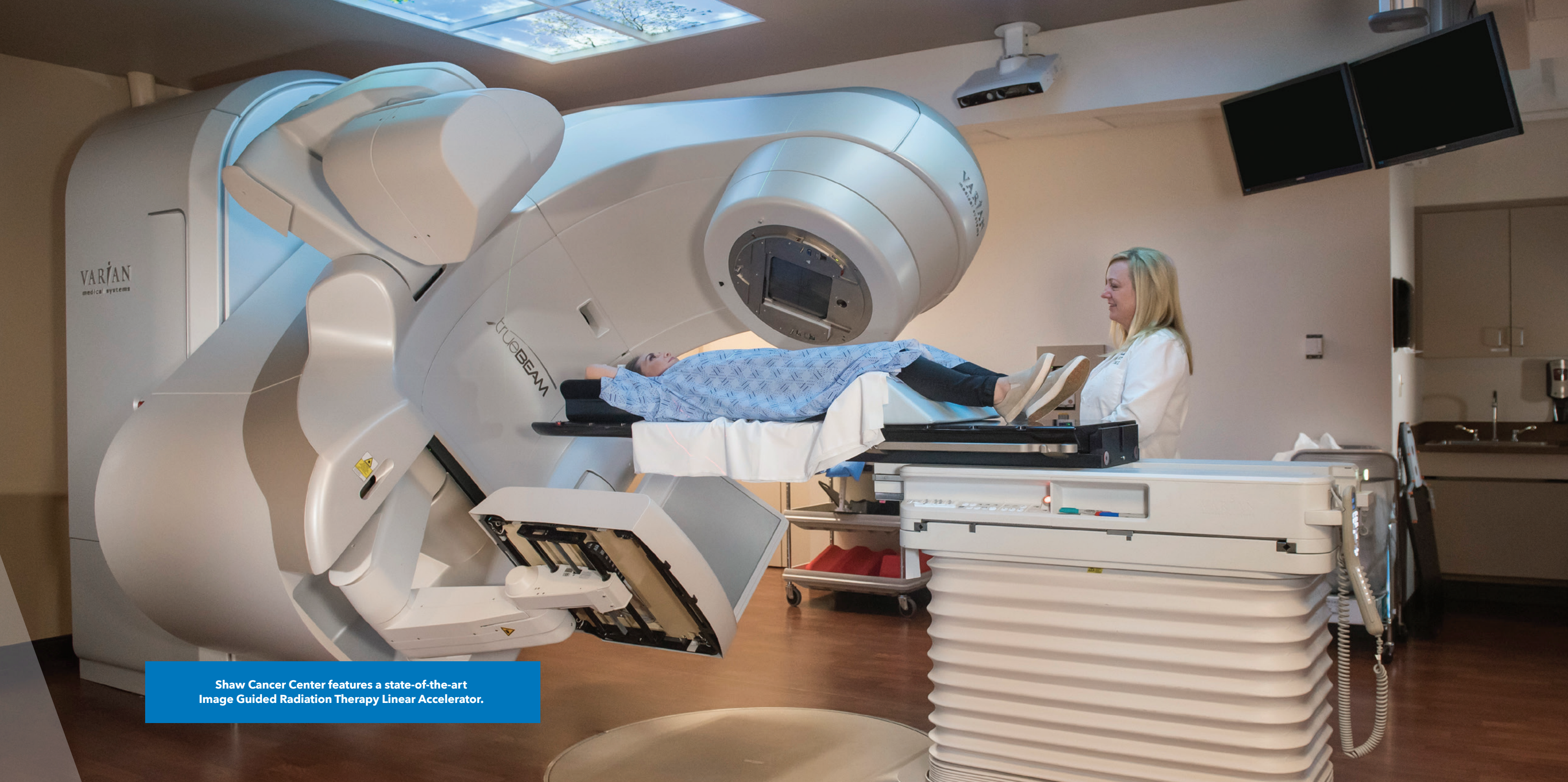
Shaw Cancer Center features a state-of-the-art Image Guided Radiation Therapy Linear Accelerator.