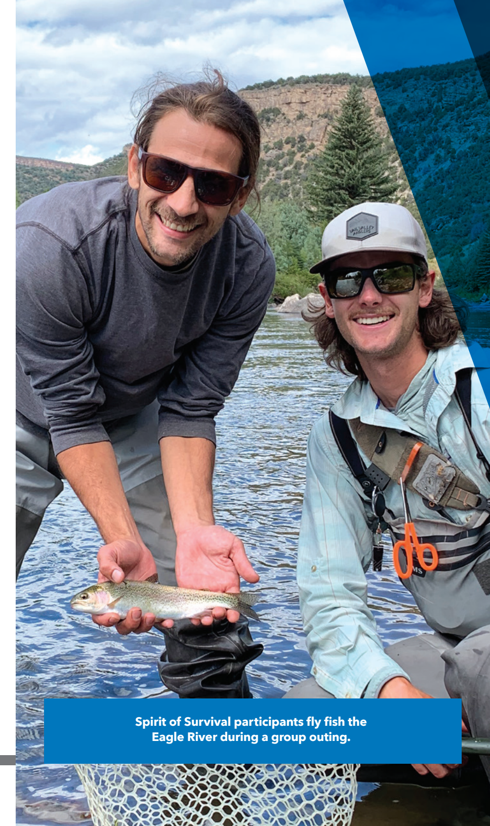
Spirit of Survival participants fly fish the Eagle River during a group outing.

The Survivorship Program at Shaw Cancer Center is supported by generous donations to Vail Health Foundation. Give online at Donate.VailHealthFoundation.org